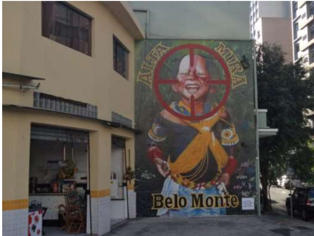
Figure 3. Outdoor mural painting depicting a Kayapo child “on the high target” (Alta Mira) in São Paulo. Alta Mira is a play on words related to Altamira, the name of the town that will be most affected by the Belo Monte dam, where its headquarters are located.